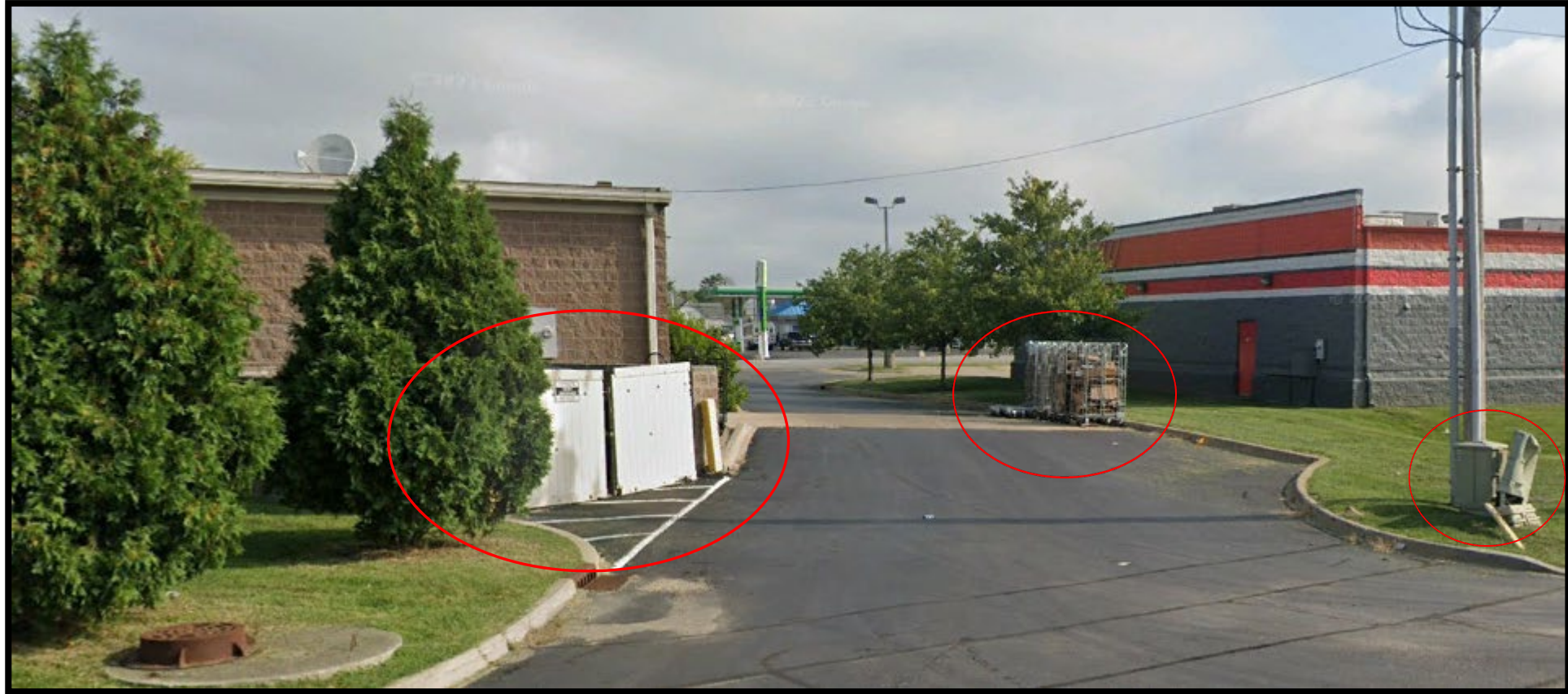
Google Earth Photo