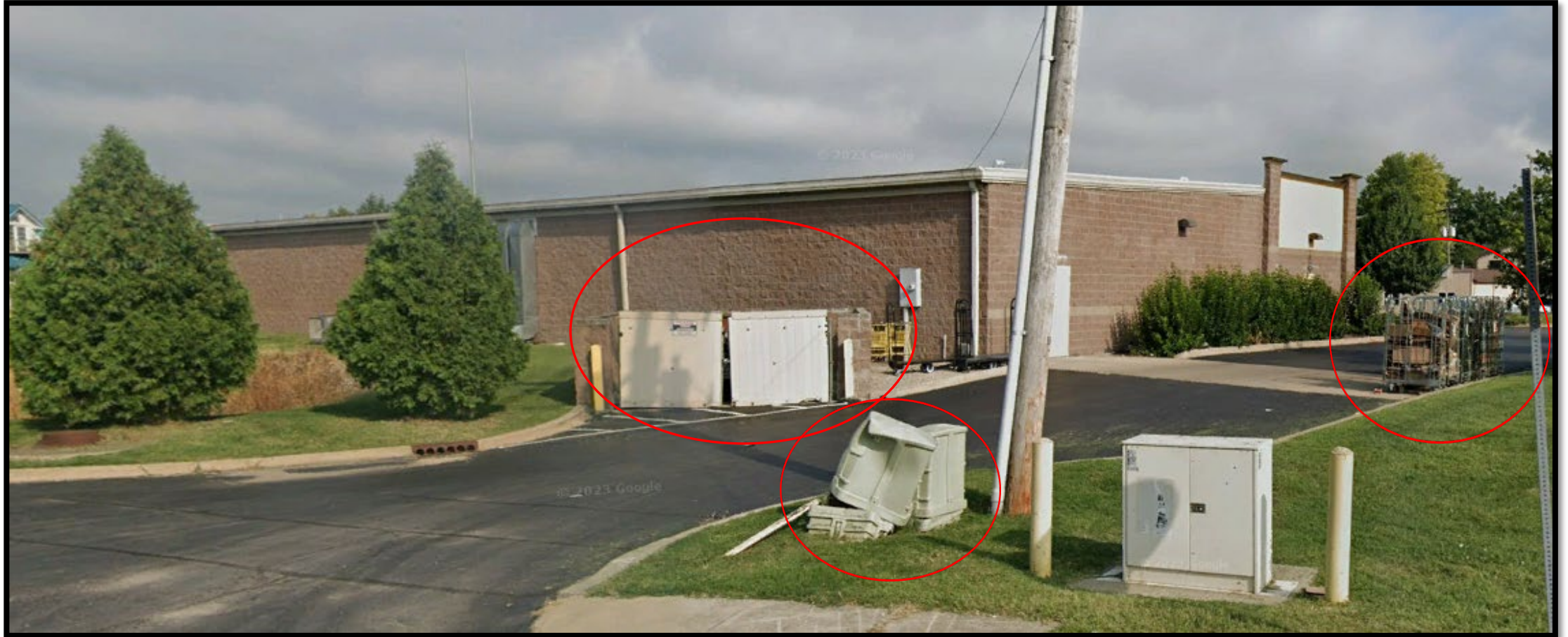
Google Earth Photo